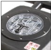
Clear recovery tank lid