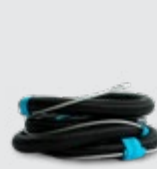
25' hose combo