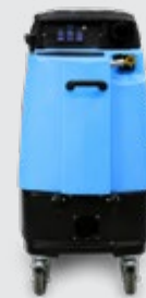
10 gallon, dual vac Carpet Extractor