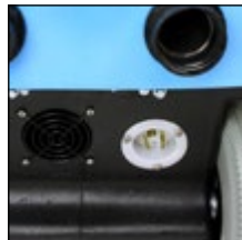
Runs on a single power cord